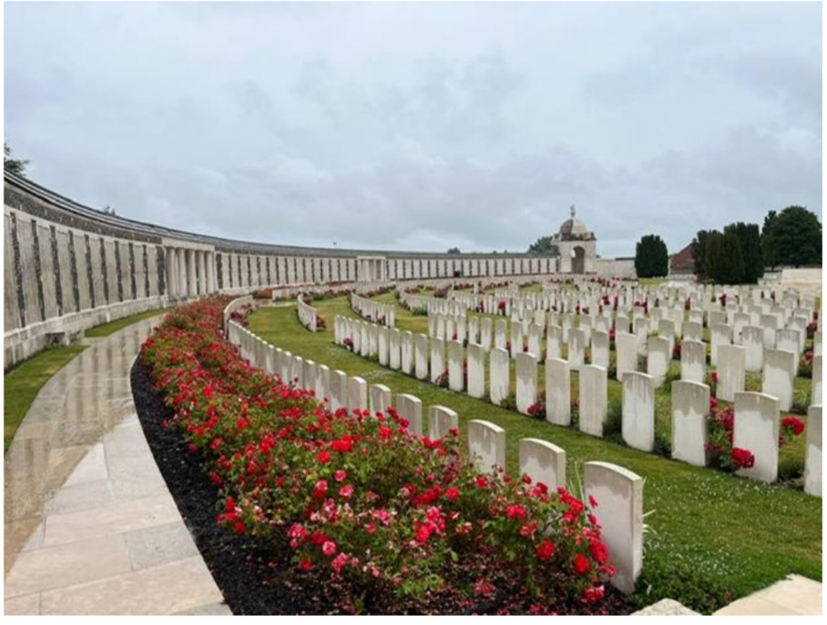
Tyne Cot Cemetery