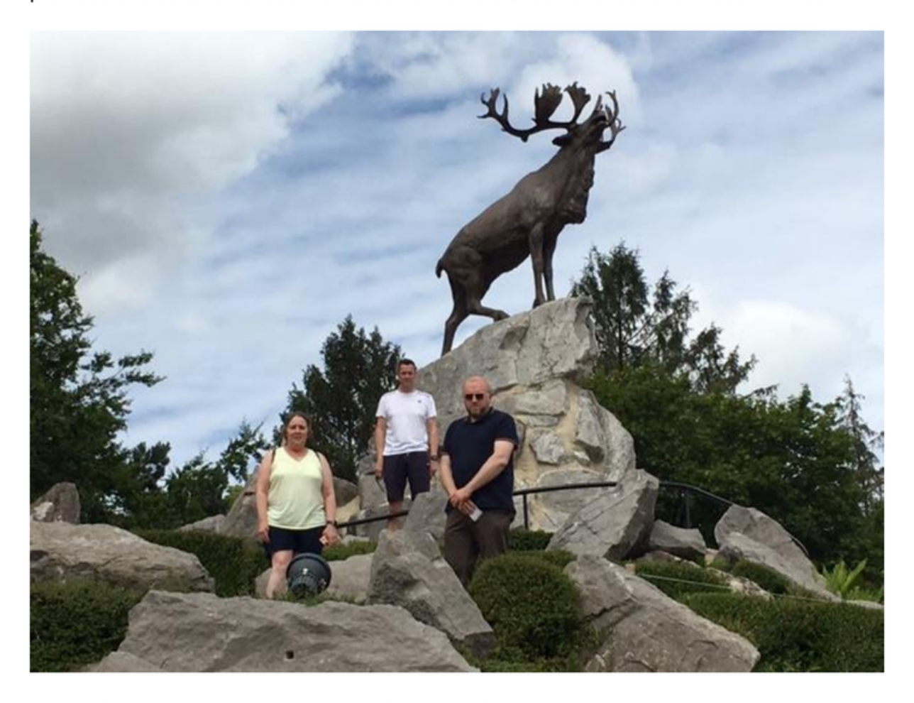
The Caribou is one of 5 such memorials on the Western Front which commemorate the location where the 1st Battalion of the Newfoundland Regiment was in action.

Beaumont Hamel was the last stop which highlighted the huge sacrifice that one small community made. It was named after the Royal Newfoundland Regiment, which had provided one battalion of 800 men to serve with the British and Commonwealth Armies.