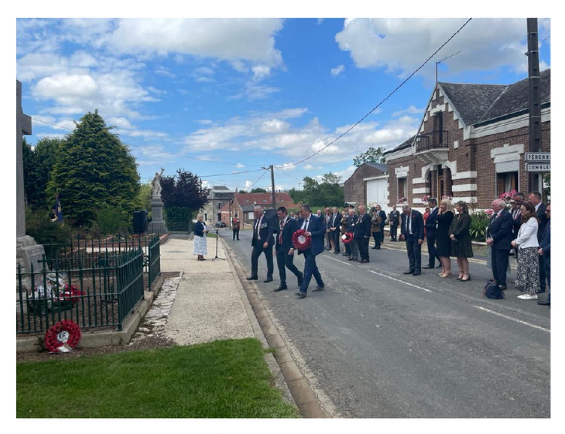
Irish Service of Commemoration at Guillemont

Members of the delegation were deeply moved by the services and the extent of the commemorations to those who gave their lives on the Somme.