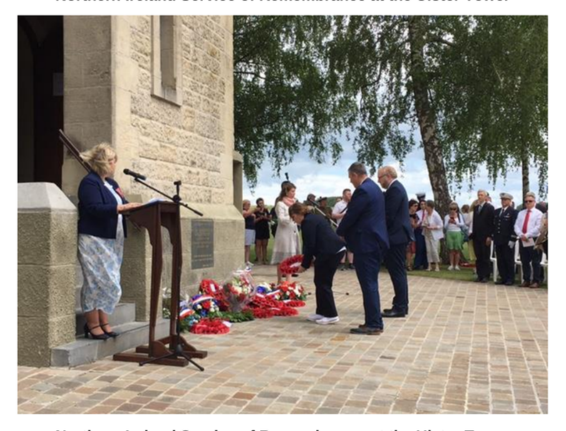
Northern Ireland Service of Remembrance at the Ulster Tower