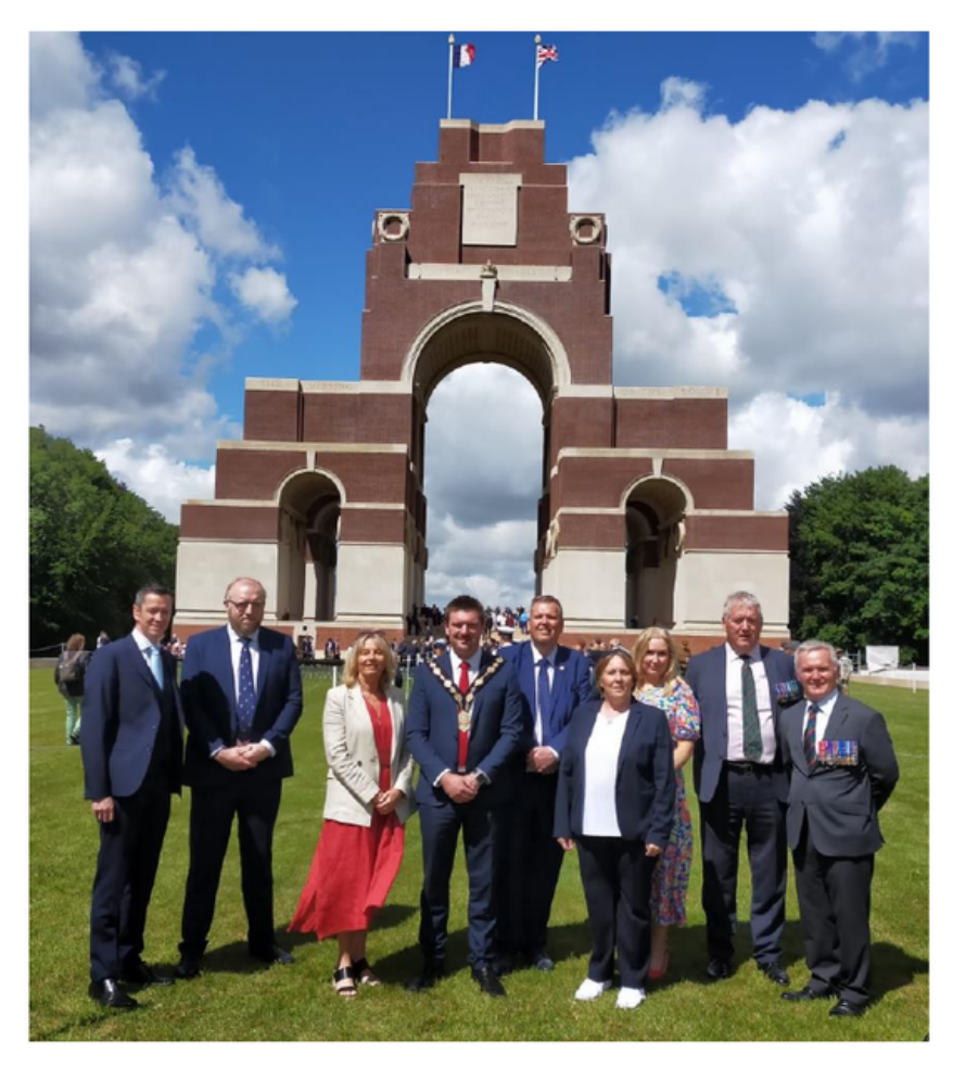
The Commonwealth Service of Remembrance at Thiepval.