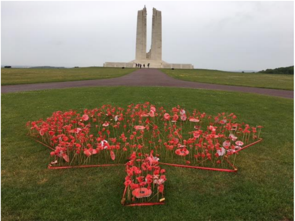
Canadian National Memorial at Vimy Ridge