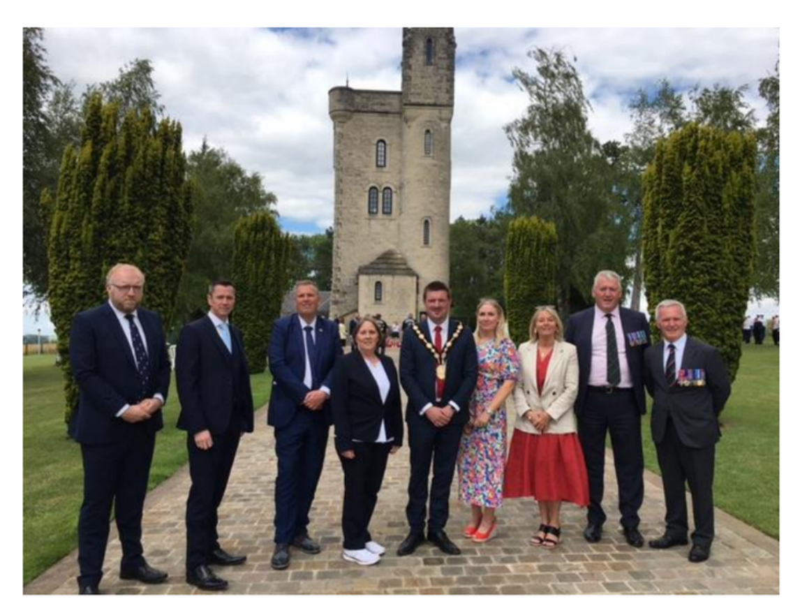
Northern Ireland Service of Remembrance at the Ulster Tower